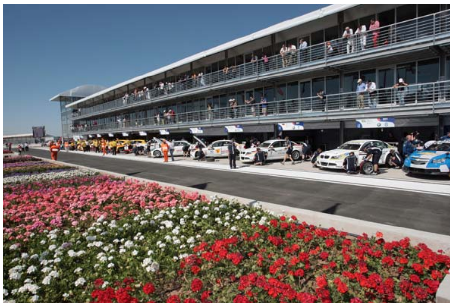
The impressive pit building, erected near the walls of the Royal Gardens

In the second race Nicola Larini scored Chevrolet's second victory of the day, crossing the line with a slim margin on Yvan Muller's SEAT and Huff.